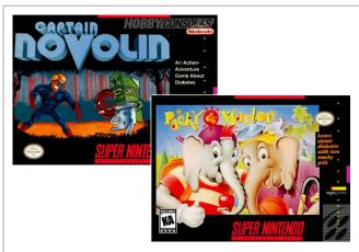
Figure 1: The first diabetes educational video games, for SNES. Left: Captain Novolin -1992. Right: Paky and Marlon -1995

★ Constructivism posits that exploration and problem solving create the context in which learning occurs in the pre-operational children stage.