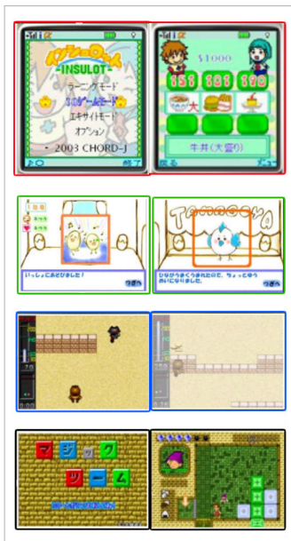
Figure 3: Feature phone games. From top to bottom: Insulot 2005 - slot game for carbohydrates measuring, Egg Breeder 2004 - Breed a diabetic egg until it hatches, Detective 2004 - Help a diabetic detective to catch a villain, Building Blocks 2004 - Block building game

The concreteness of the plastic food toys, used in Yorkhill, and their depiction of real world objects are the base line for constructivistic “hands-on” learning. According to that, and in order to avoid perturbing the existing ecosystem, we decided not to alter the existing approach but enhance it through technology by adding all the missing features.